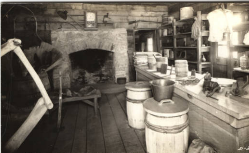
The Lincoln-Berry Store