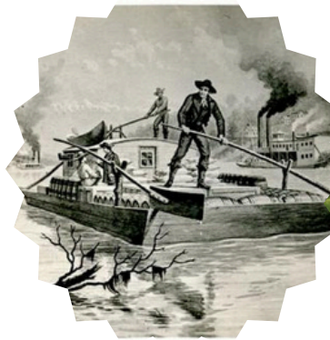
Lincoln fights the currents as a boatman

an incredibly challenging task: they had to navigate dangerous river waters, defend their cargo from attacks by thieves, and skillfully avoid collisions with large ships. This demanding adventure tested Lincoln's strength and courage, helping him to develop character that he would need to face the hardships that lay ahead.