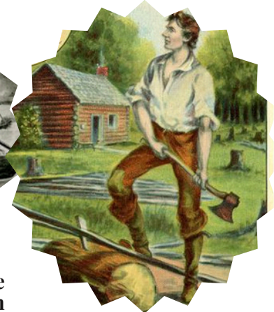
Lincoln wields his mighty ax