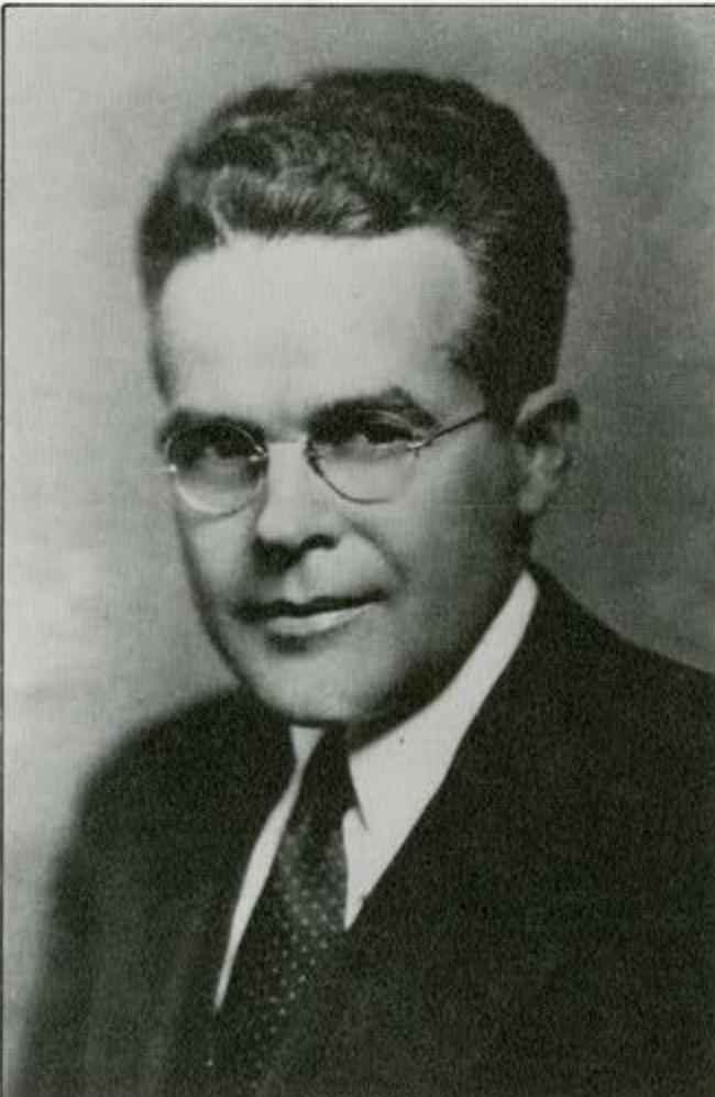
From the Louis A. Warren Lincoln Library and Museum