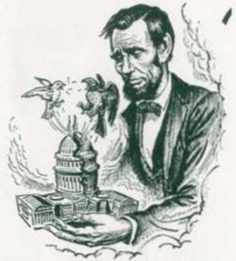
Drawn For The Journal Herald Third Place

(Reprinted by permission of The San Diego Union , (Copley Newspapers).)