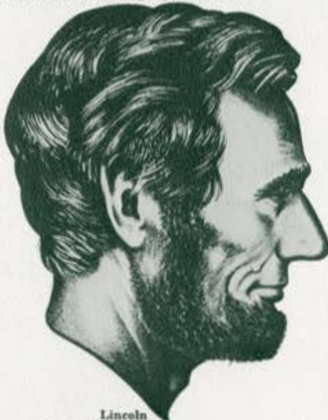
Lincoln