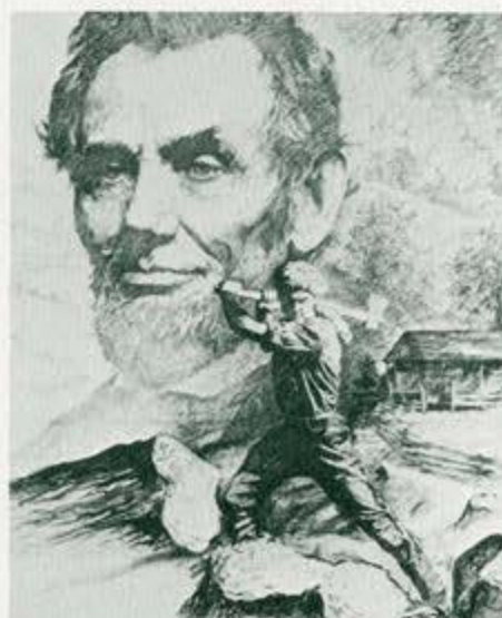
Lincoln—Indiana Boy by M. Leone Bracker