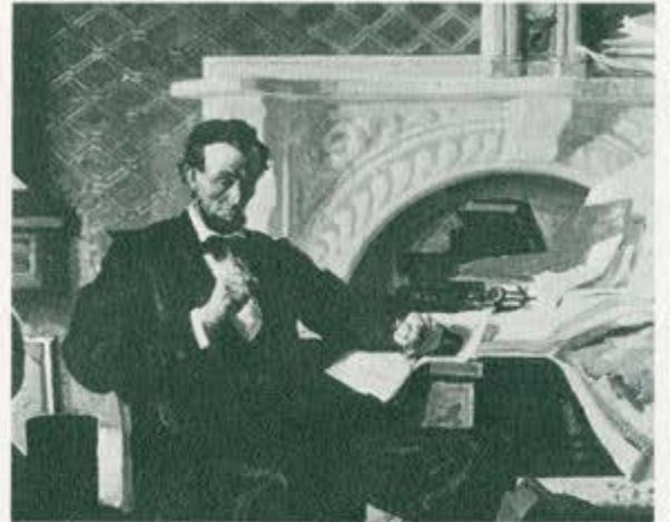
Lincoln Proclaiming Thanksgiving by Dean Cornwell