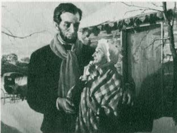
Lincoln's Farewell To His Stepmother by Frederick Mizen