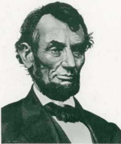
Lincoln A scratchboard drawing by Jose Calvillo