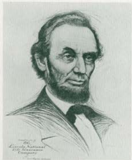
Sketch made from the William Edward Marshall engraving of Abraham Lincoln.