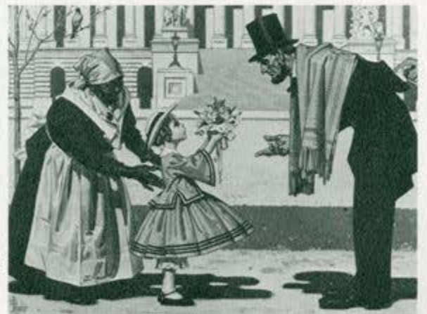
A Great Friend To Little Children by J. C. Leyendecker