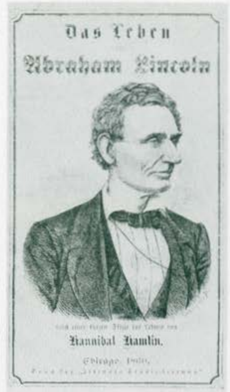
From the Illinois State Historical Library Cover title of the rare German 1860 campaign biography. This is the only copy known to exist with the original front wrapper.