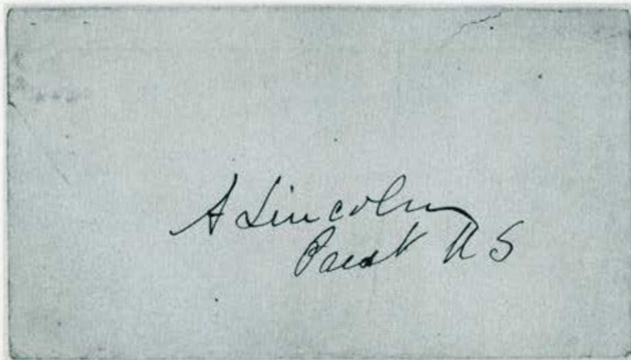
Envelope addressed to Lincoln from Willard's Hotel.

Quite a few of the letters were written by men of prestige or responsible position, such as Oliver P. Morton, George B. McClellan, Peter Cooper, John W. Forney,