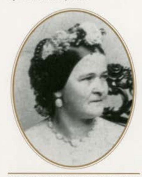
Another view of Mrs. Lincoln, also taken at her January 1862 sitting. (Detail from TLM#103)

The role of the First Lady is unique in American politics. The Constitution assigns no duties to the president's spouse, who is neither elected by the voters nor confirmed by the Senate. On paper, few First Ladies have been granted any governmental authority.