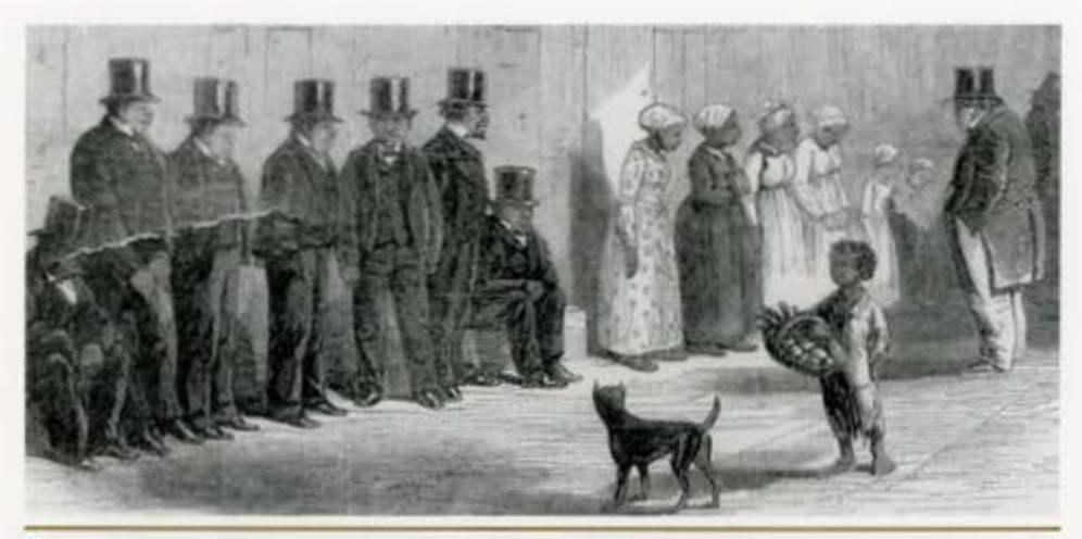
Slaves awaiting an auction in New Orleans; during Lincoln's term in Congress, a slave market operated within sight of the Capitol. Illustration from Harper's Weekly , January 24, 1863. (TLM #4432)

Lincoln began the Peoria speech by examining the historical background to the controversy over the Kansas-Nebraska Act and the extension of slavery. He reviewed the valuable role the Missouri Compromise had played in American history and defended its special status. Lincoln then denounced Douglas's repeal of the compromise, for opening to slavery territory where it had prohibited for decades. "I think, and shall try to show, that it is wrong," Lincoln declared; "wrong in its direct effect, letting slavery into Kansas and Nebraska - and wrong in its prospective principle, allowing it to spread to every other part of the wide world, where men can be found inclined to take it."31