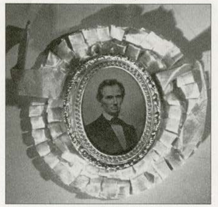
FIGURE 3. 1860 campaign button made from a ferrotype (tintype) copy of the Cooper Union photograph.