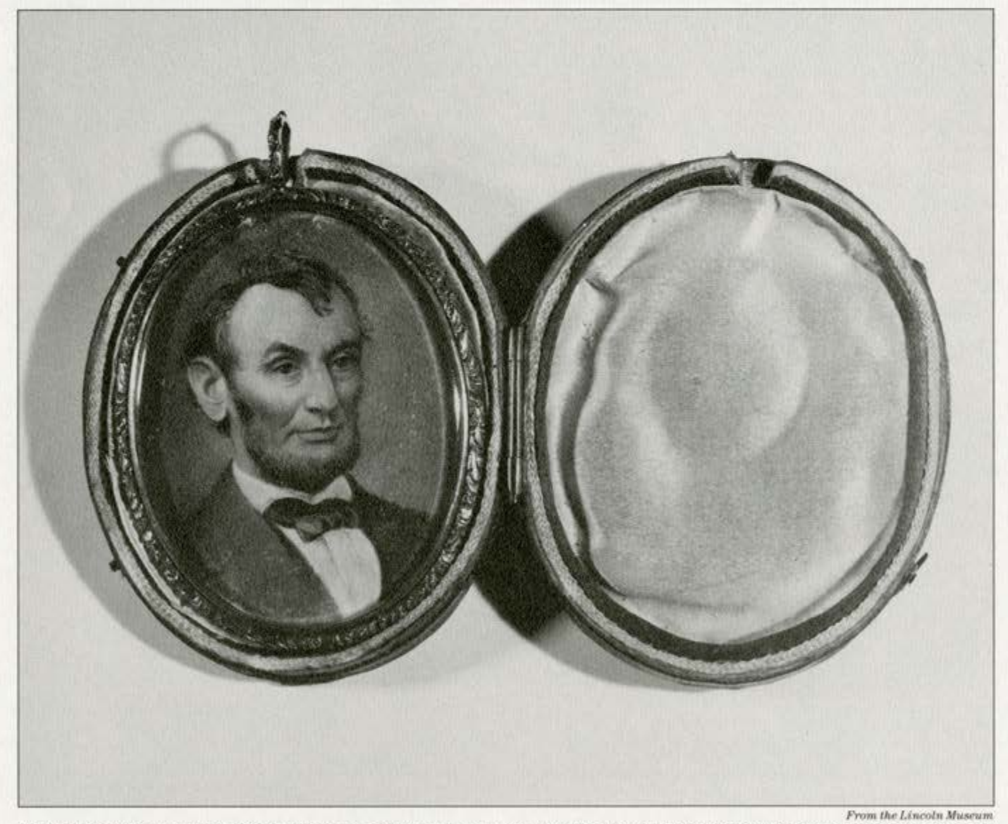
FIGURE 2. Miniature by Daniel Huntington, egg tempura on ivory, about 1864. In the 1840s people thought of photographs as inexpensive miniatures. By 1864, though, photographs had made miniatures virtually obsolete. Ironically, this miniature is actually a copy of a photograph.

Did you ever see a real, pretty miniature? I do not mean either an ambrotype, daguerreotype or photograph, but a regular miniature painted on ivory. Well, a Philadelphia artist (Brown,