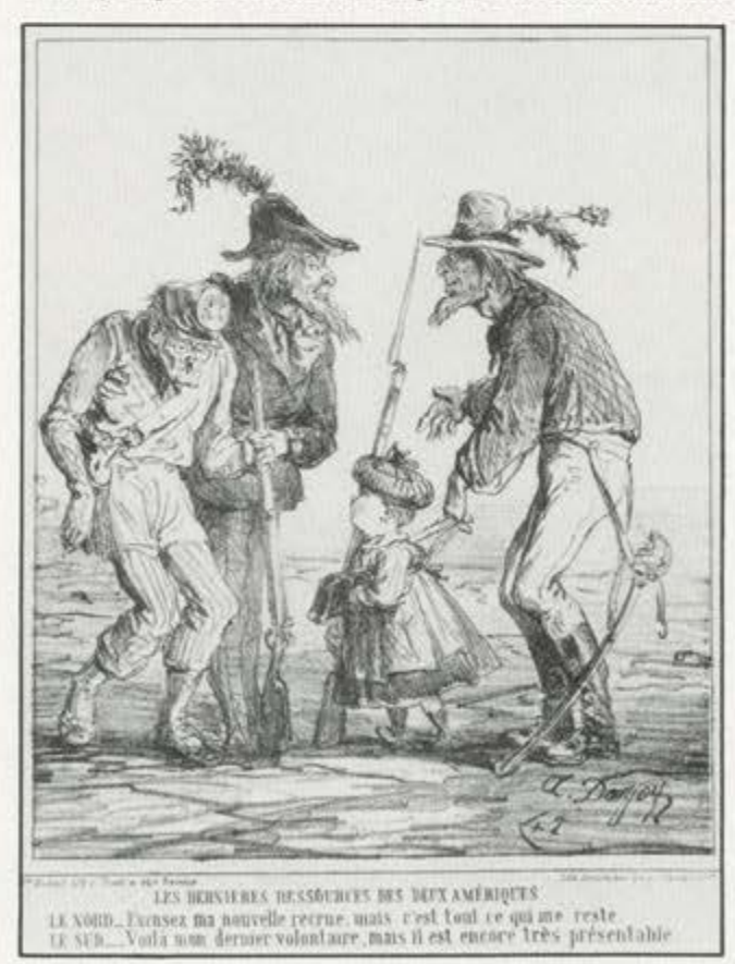
From the Louis A. Warren Lincoln Library and Museum

The presence of the Monitor and the Merrimac in the cartoon discussed above reminds us that Europeans naturally placed a heavy emphasis on the naval aspects of the American Civil