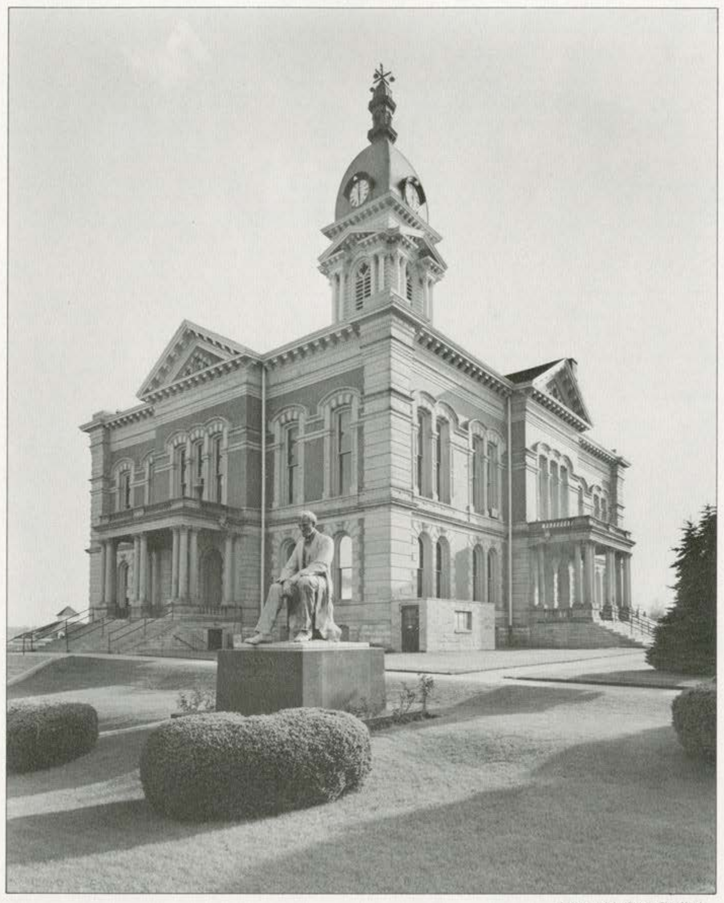
FIGURE 3. Wabash, Indiana, 1983.

honestly reports the chaos of poor taste which now surrounds many Lincoln statues. The bronzes endure, but the American urban landscape changes rapidly with the result that Lincoln statues now appear against a backdrop never dreamed of by the artists. Abraham Lincoln in Newark seems sadly to contemplate a Burger King sign. In Boston, Massachusetts, the Great Emancipator releases a slave from bondage, and