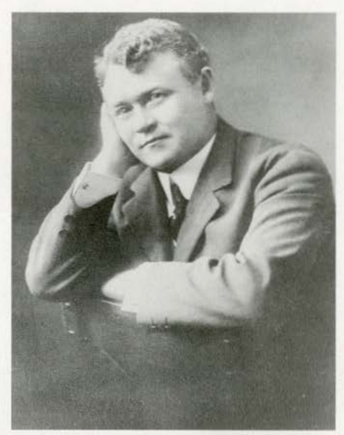
From the Louis A. Warren Lincoln Library and Museum

As we have seen, collecting Lincoln autographs and manuscripts began while Lincoln was still alive. Collecting printed materials, on the other hand, apparently began only after Lin-