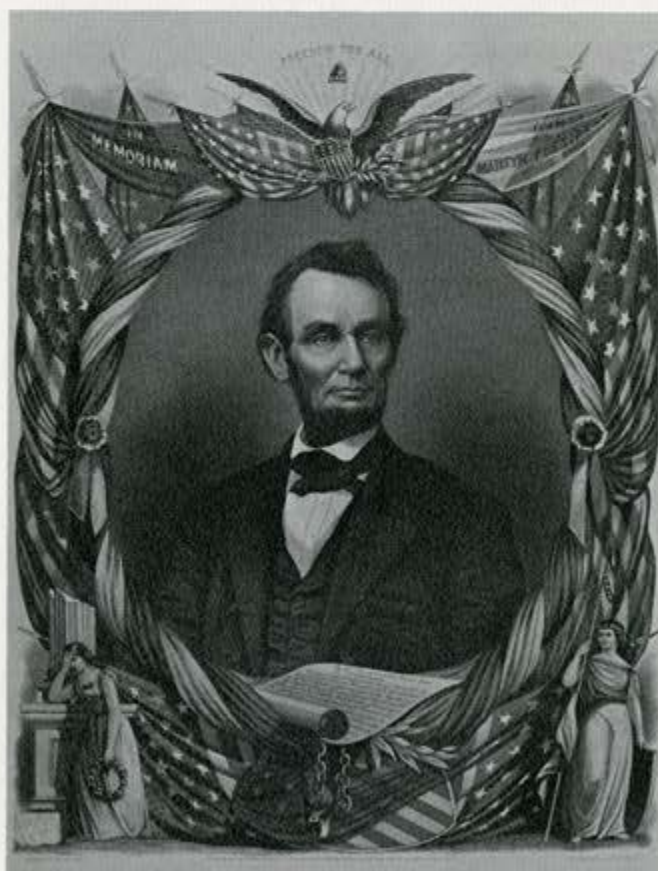
From the Louis A. Warren Lincoln Library and Museum

The passage of Stephen A. Douglas's Kansas-Nebraska Act