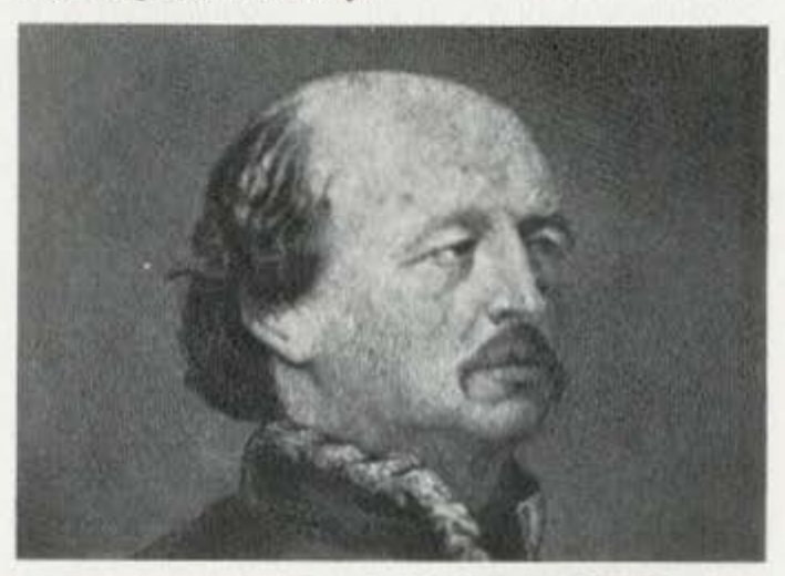
From the Lincoln National Life Foundation

"To do these things required much money," Butler pointed out needlessly. "The poor had to be fed, the streets had to be cleaned, the protection from yellow fever had to be made sure, and able-bodied, idle men had to have employment to keep them from mischief and maintain their families. There was power enough to do all this, but in what manner could it be paid?" He also had to find funds to support the Charles Health had to find funds to support the Charity Hospital and other hospitals in the city.