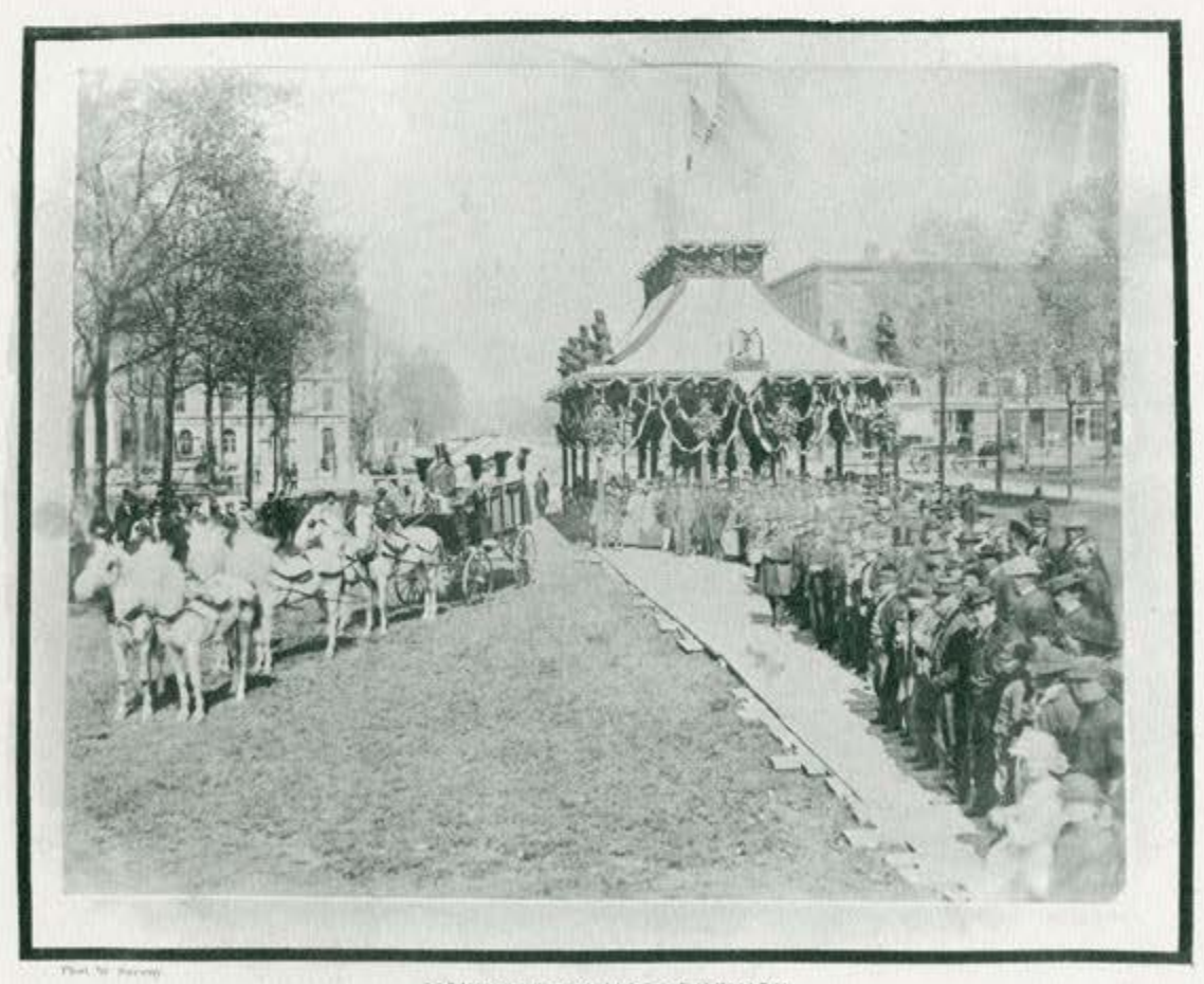
MONUMENT SQUARE PAVILLION ELEVELAND, 0. Remains of President Lincoln tying in State

As the train moved slowly into the station, Governor Brough and General Hooker could see through the windows vast crowds of people on the green hillsides along the track of the railroad. The depot was heavily draped with mourning cloth and flags,