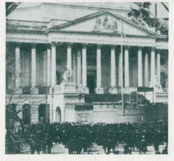
Stereoscopic photograph of unfinished capitol building showing crowd gathering to hear Lincoln's First Inaugural Address.

Louisiana avenue to Pennsylvania, past Willard's Hotel,